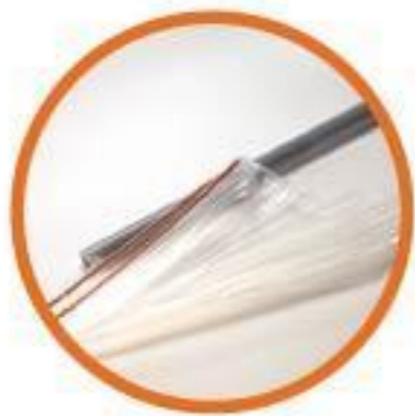
Endo pouch with introducer