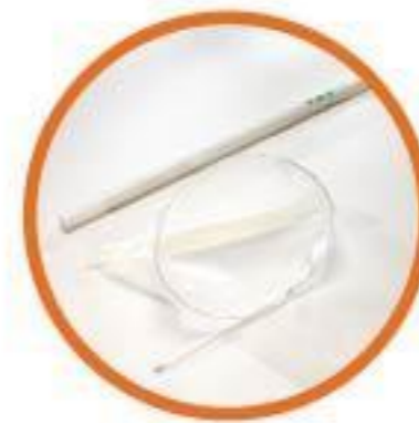
Endo pouch with memory wire