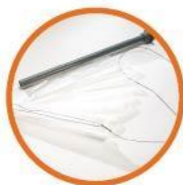
Endo pouch with suture tie